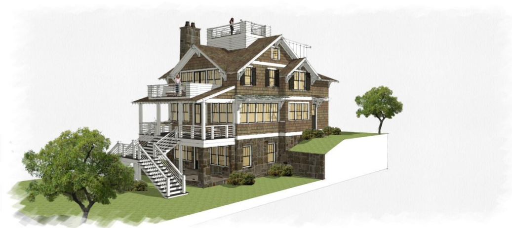
Sunnydale House Plan